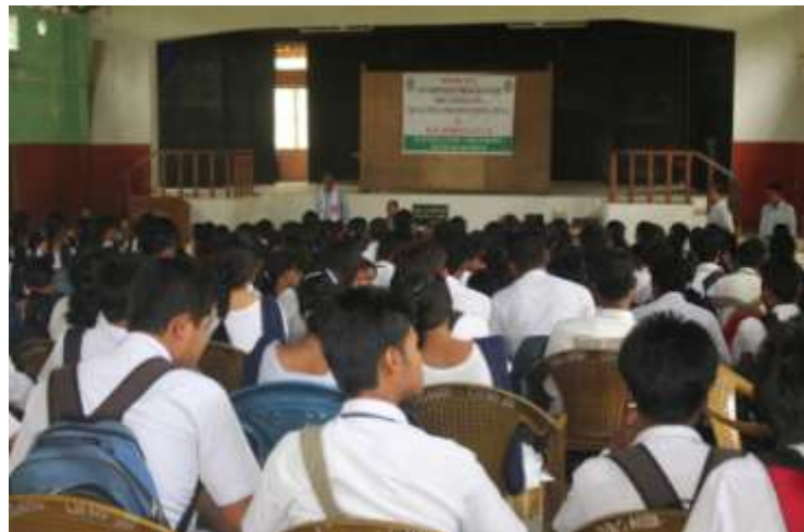
Photograph: Health Awareness and Check up Camp