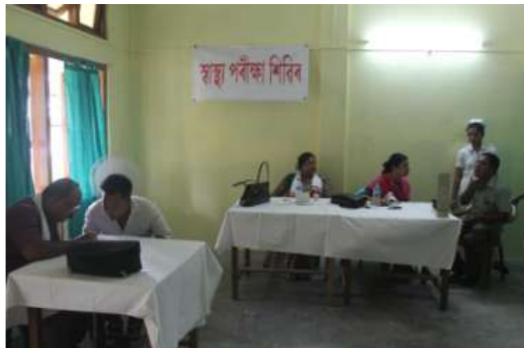
Photograph: Inauguration of Health Centre and Health Awareness & Check up Camp