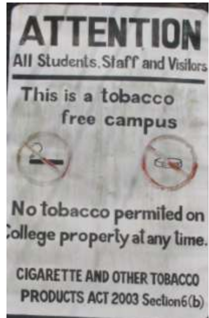
Photograph: Anti-nicotine programme