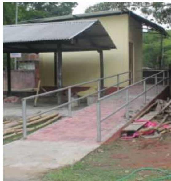
Photograph: Differently able friendly Toilets (Girls' & Boys')