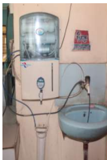
Photograph: Activities towards healthy practices