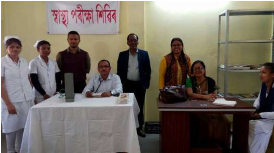
Photograph: Health Check up Camp