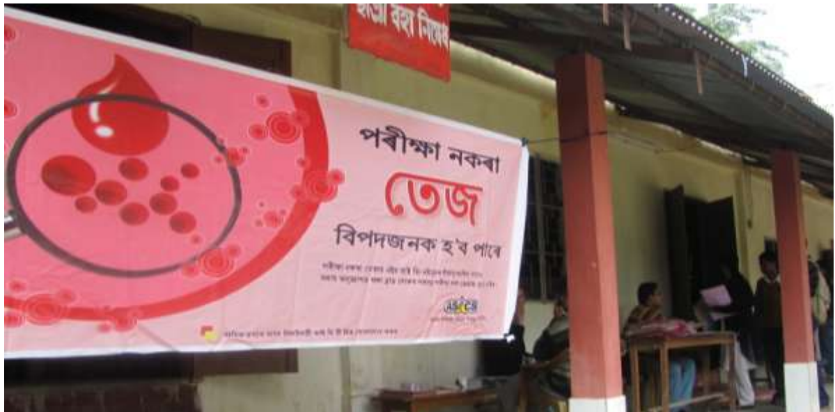
Photograph: awareness about Blood Donation and HIV