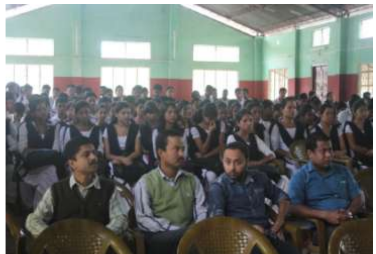
Photograph: Health Awareness and Check up Camp