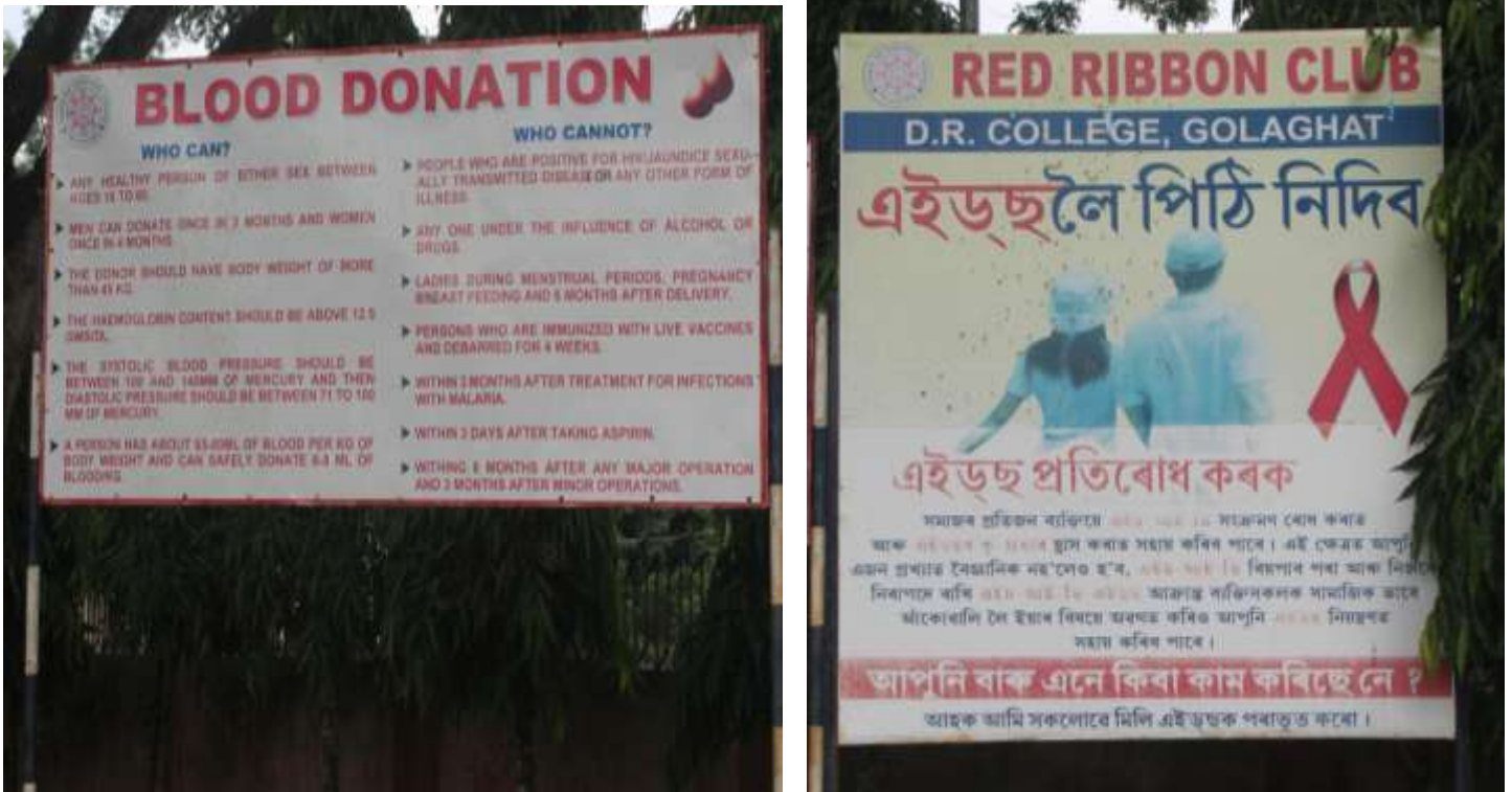
Photograph: Hoardings for the awareness about AIDS and Blood Donation

13. During the Academic Session 2016- 2017, with the initiative of the HHC, D.R. College necessary steps were taken to provide two Nos. of Differently Able friendly Toilets (Boys' and Girls') and five Nos. of Ramps. The HHC also took initiative to install thirteen Nos. of dustbins at different locations keeping in view of the cleanliness of the campus during the session.