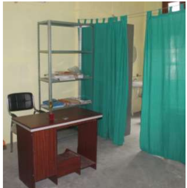
Photograph: Some requirement of the HHC purchased from General Development Fund, UGC.